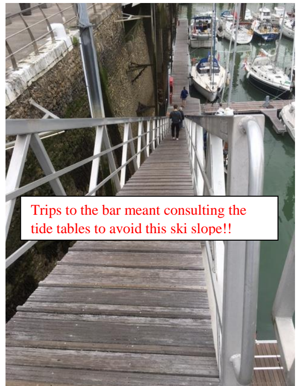
Trips to the bar meant consulting the tide tables to avoid this ski slope!!

All in all, an enjoyable trip hampered only by the weather!