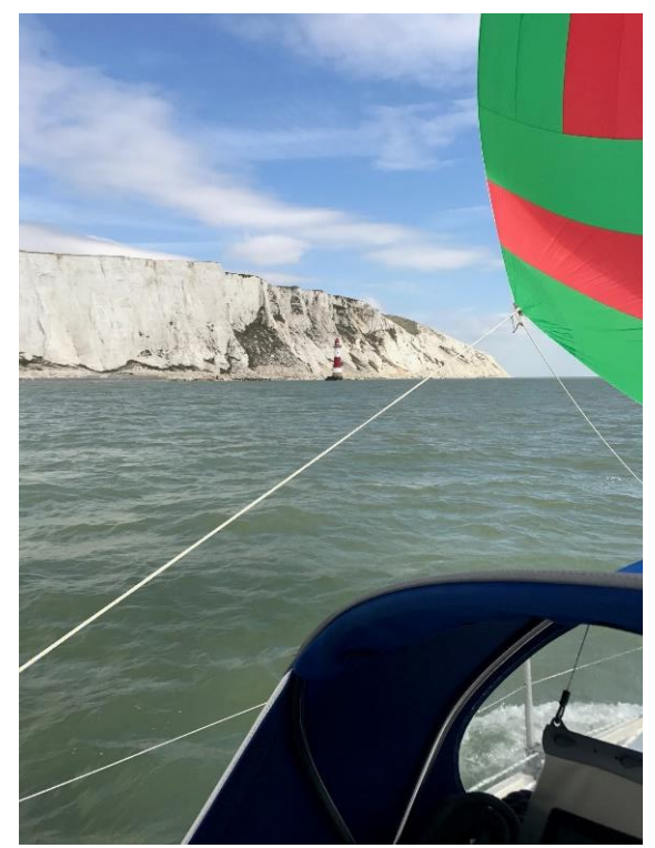
Salute approaching Beachy Head flying sneaky chute!

The Frostbite competition, deferred from March because of bad weather was included in the passage to Eastbourne for the Rally. The rescheduled course was a timed run from S of the Newhaven East Pier to the red can off Langley point. For the boats that left late morning it proved a cracking sail.